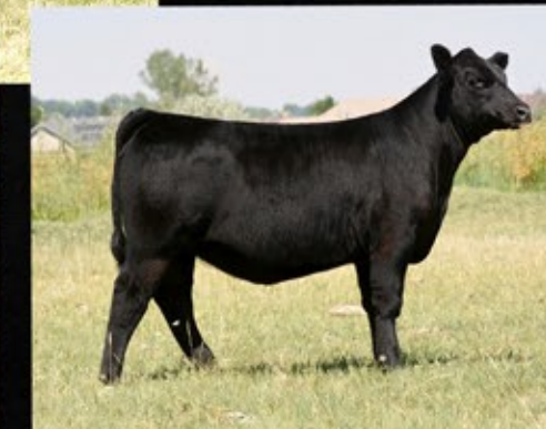
CADILLAC RANCH X QUEEN LATIFAH 700