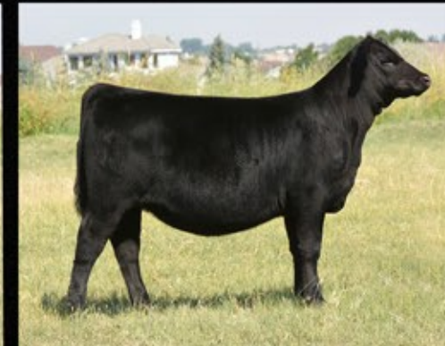
EDGE X 107