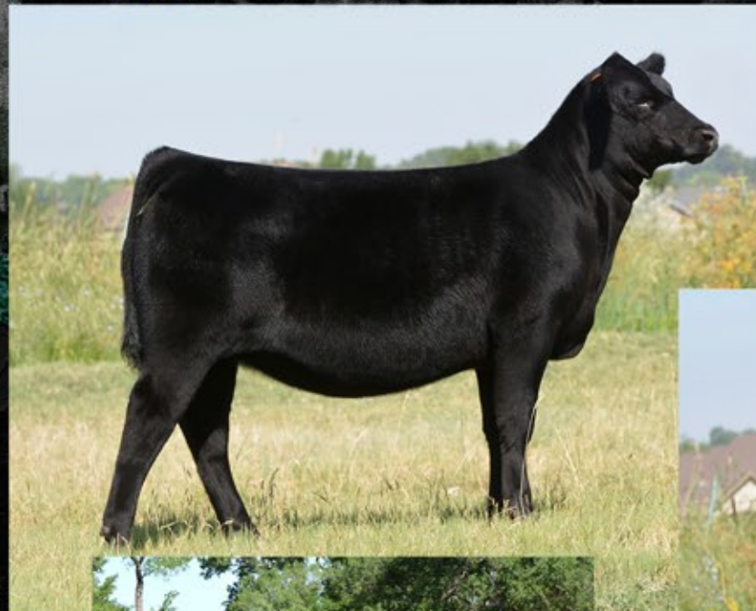
EDGE X HONEY 515