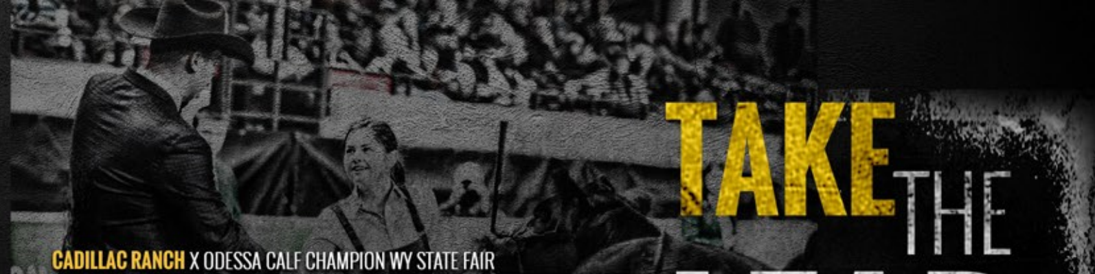
CADILLAC RANCH X ODESSA CALF CHAMPION WY STATE FAIR