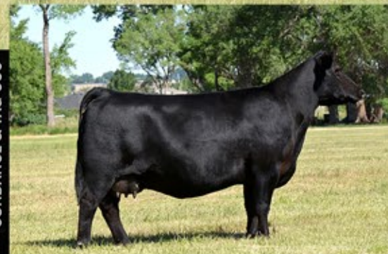
ZENA 428 DAM OF SUNDANCE & TAG 005