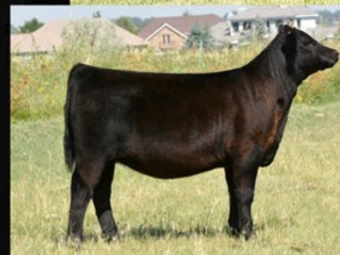
KR QUALITY X SUNDANCE'S MOM 428